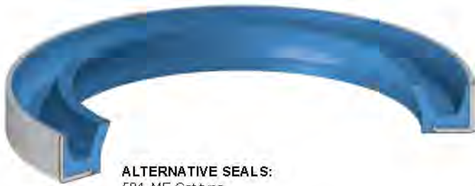
ALTERNATIVE SEALS: 504, ME Cat type